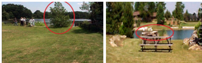
Left: A tree is obstructing this spillway. Right: Notice the landscaping directly behind the table. Obstructions in the spillway reduce the capacity to convey water. They also can collect debris, further diminishing the capacity of the spillway.

across the spillway should not be constructed in the spillway. Earthen channels should be protected by a good grass cover, an appropriately designed rock cover, concrete, or other various types of erosion control matting. Grass-lined channels should be mowed at least twice per year to maintain a good grass cover and to prevent trees, brush, and weeds from becoming established. Poor vegetal cover can result in extensive and rapid erosion when the spillway flows.