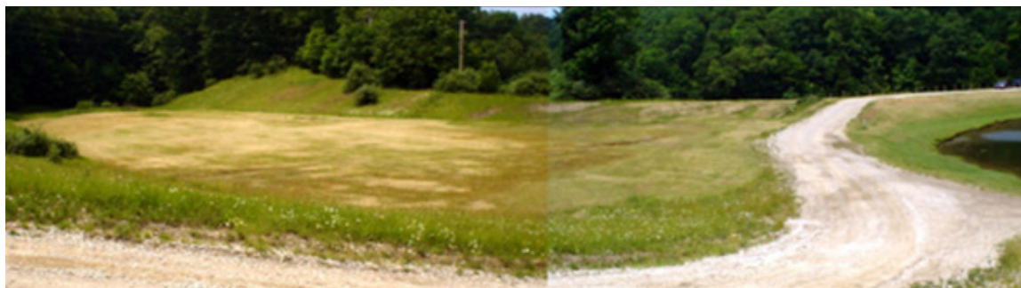
This open-channel emergency spillway is clear of trees, brush and other obstructions. Also note the good grass cover.