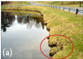
(a) Collapsed muskrat burrows increase shoreline erosion and sloughing. (b) This shoreline has eroded due to lack of proper erosion protection leading to sloughing and cracking of the slope.