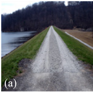
(a) Crest with a good cover that will reduce the effects of vehicular traffic.