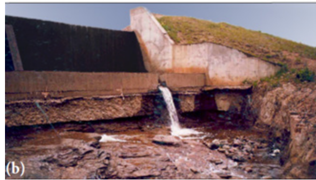
(a) A spillway outlet area as originally constructed. (b) Severe erosion has undermined the spillway outlet and threatens the overall structural safety of the spillways.