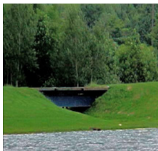
This bridge blocks much of the spillway, reducing its ability to convey water.